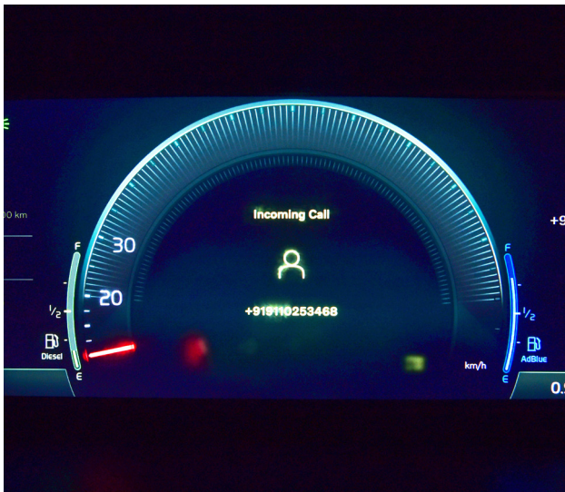
Driver information display