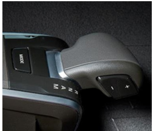
I-Shift Automated Manual Transmission

Pre-trip check diagnoses all the vital parameters of the truck and alerts if something needs your attention with pop up message on the driver information display. If not, just turn the ignition and keep rolling. You can avoid the physical inspection of the truck at the beginning of every shift, thus improving the utilization.