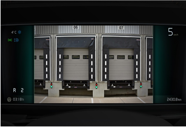
Rear view camera