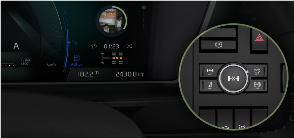
Traction control knob and display

The new Traction Control unit makes it easier to handle demanding situations like loose soil, slush etc... which is very common during monsoon. The more you turn the knob, the more traction you get. You also get visual feedback of the traction status in the instrument display.