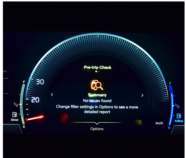
Pre-trip check diagnostics